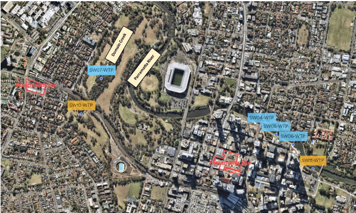
Sydney Metro West - WTP western surface water sampling locations (Parramatta and Westmead). New sample locations in yellow.