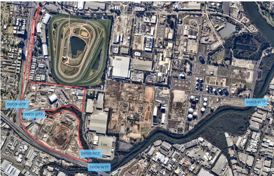
Sydney Metro West - WTP eastern surface water sampling locations (Clyde MSF)